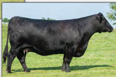
G A R Momentum N1287 - Dam of Lot 21