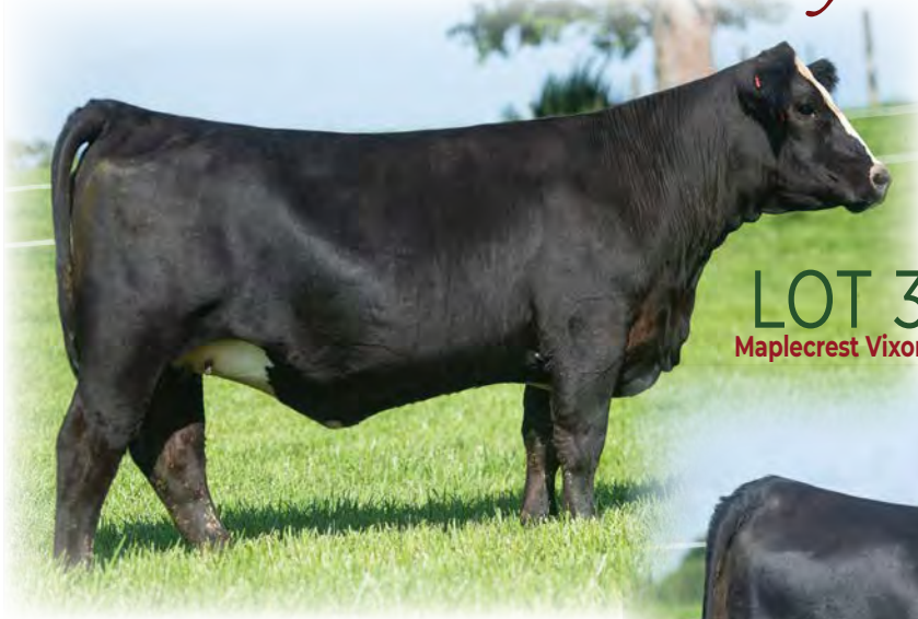
LOT 34 Maplecrest Vixon 216K