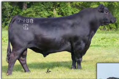
G A R Home Town - popular sire of Lot 21

This daughter of Home Town is a maternal sister to the $38,000 top-selling female at a past Maplecrest production sale and is working as a donor in the Butz-Hill program in Iowa. L2173 features a nice blend of calving ease and solid growth with elite marbling and $B and $C indexes. Sells bred to GB Fireball on May 17 and exposed to Pamer MC Touchdown 003.