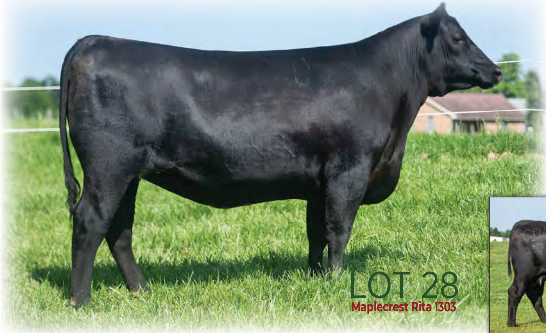
LOT 28 Maplecrest Rita 1303