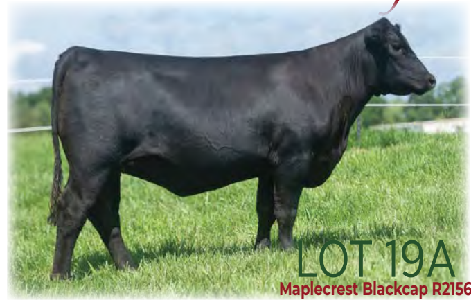
LOT 19A Maplecrest Blackcap R2156

Sells due to calve January 7, 2024 to GB Fireball 672.