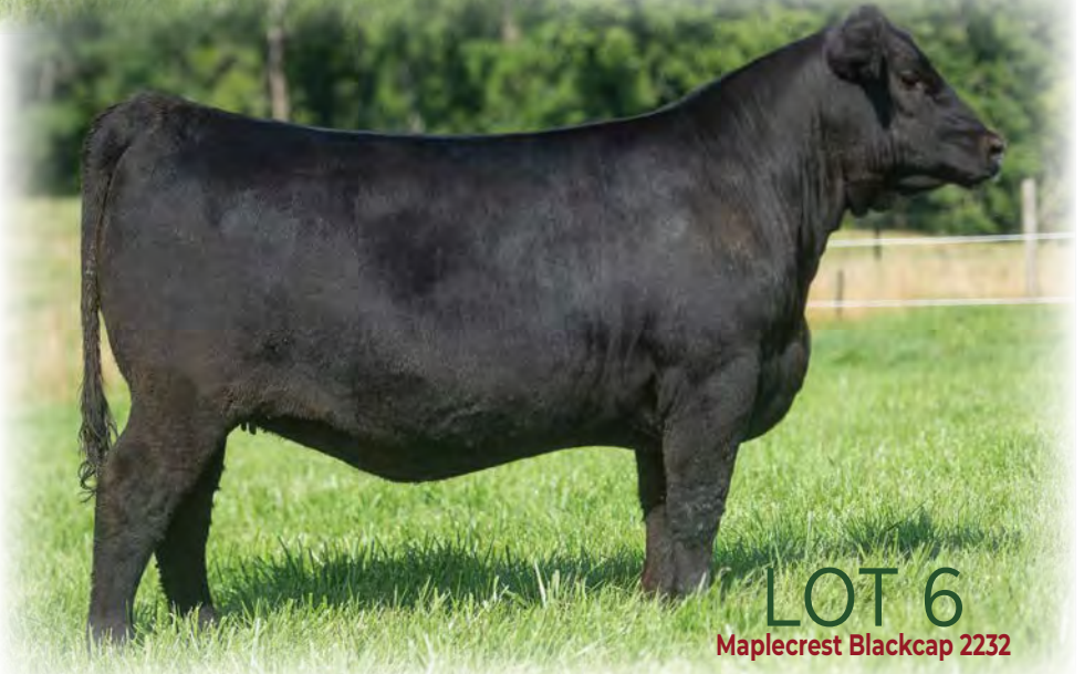
LOT 6 Maplecrest Blackcap 2232