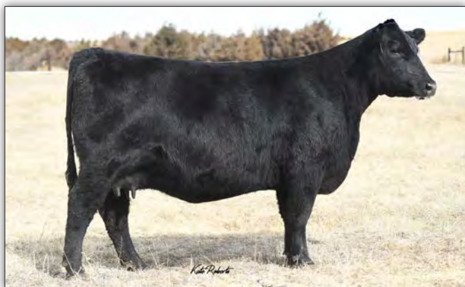
Maplecrest Fanny 0063 - The $120,000 valued daughter to 8017

Here is a donor entering the prime of her life with a proven track record and pedigree diversity for great mating flexibility. 8017 is best known for producing the $120,000 valued Maplecrest Fanny 0063 who serves as a donor for Maplecrest and Baldrige. 8017 offers a very balanced EPD profile backed by a production record of 3 at 111 for birth, 114 for weaning, 111 for yearling, 118 for IMF and 111 for ribeye. Check out her elite $Maternal and impressive $Combined Indexes. Flushed 4 times for an average of 10 high quality embryos. She will calve prior to sale day to Connealy Commerce.