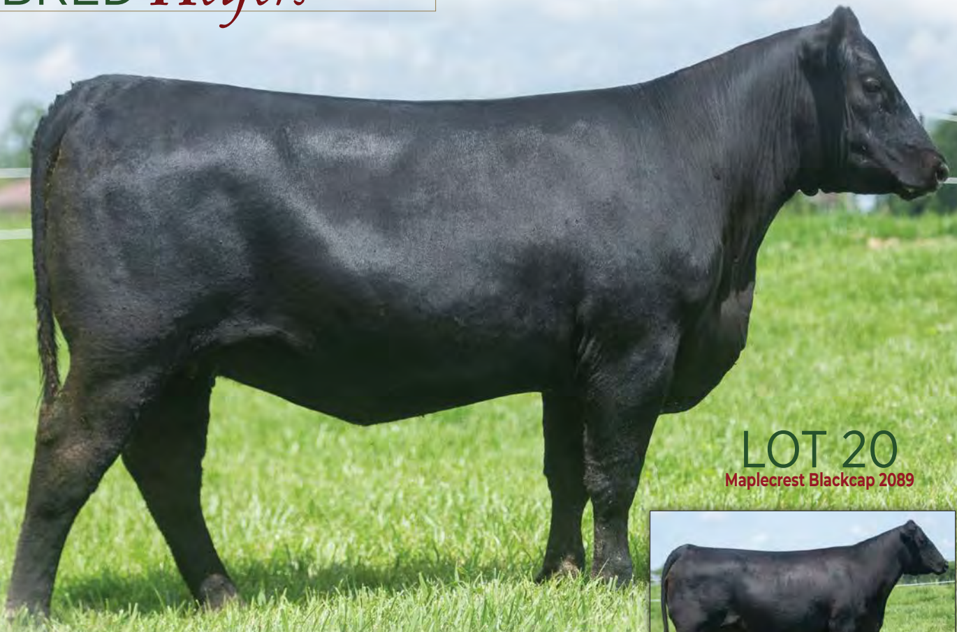
LOT 20 Maplecrest Blackcap 2089