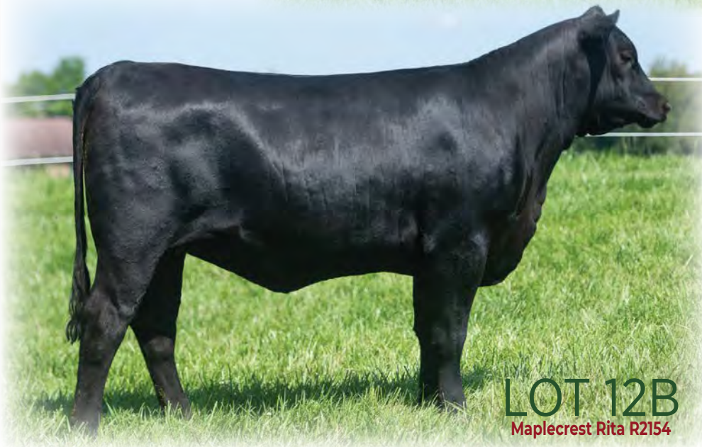
LOT 12B Maplecrest Rita R2154