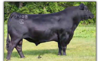
G A R Home Town - Popular sire of Lots 4 through 8