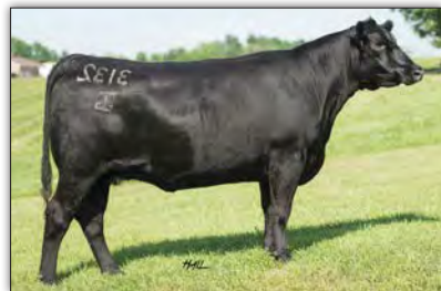
Maplecrest & Hillhouse Foundation Donor - G A R Ingenuity 3132

This attractive daughter of Ashland has one progeny ribeye ratio of 102 and was produced by the popular and valuable G A R Ingenuity 3132, who has over $800,000 in progeny sales. Her predictable genetics include extra calving ease, solid growth, elite carcass merit and impressive $ Indexes. She will calve prior to sale day to G A R Transcendent.