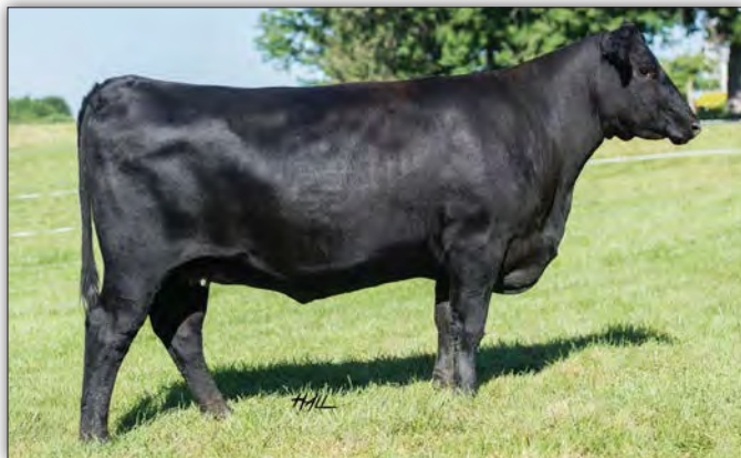
Maplecrest Blackcap F5247 - Dam of Lots 22A, 22B & 22C