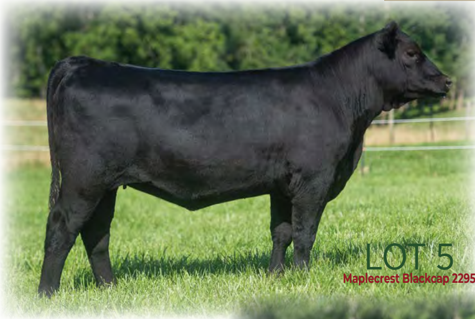
LOT 5 Maplecrest Blackcap 2295