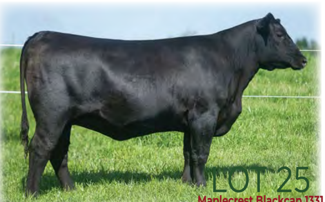
LOT 25 Maplecrest Blackcap 1331

This daughter of Quantum possesses a sire stack of featured bulls in the Select Sires lineup. She also traces directly to the N340 donor. 1331 displays a balanced EPD profile of the economically important traits. She also boasts a solid set of $ Indexes. Due to calve January 7, 2024 to E&B Wildcat.