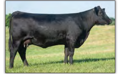
Maplecrest Blackcap R0163 - Dam of Lot 5 & Lot 23