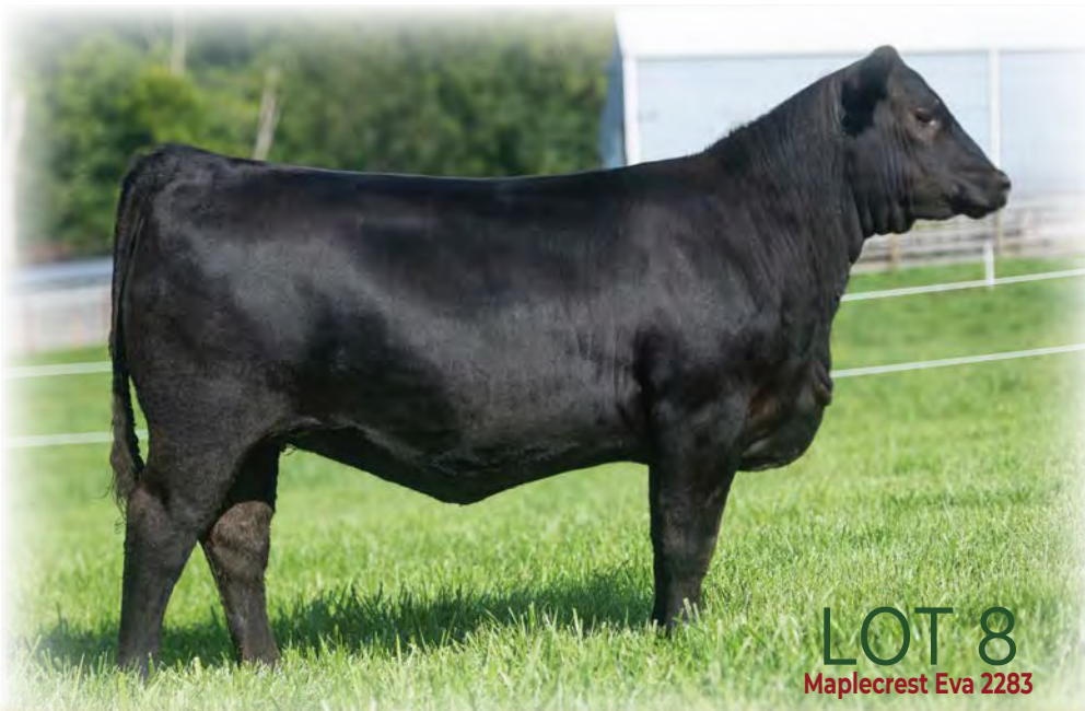
LOT 8 Maplecrest Eva 2283

This attractive daughter of Home Town posted an individual weaning ratio of 118 and delivers the expected calving ease with positive growth and impressive carcass merit. Her dam by Enhance traces directly to Maplecrest Eva 7010, the dam of ST Genetics sire G A R Storm.