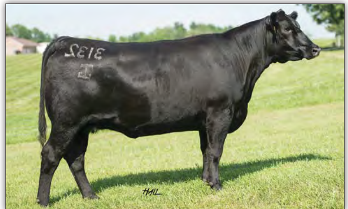
G A R Ingenuity 3132 - The legendary Dam of Lot 3 & G A R Sunbeam