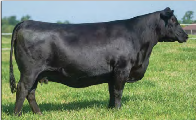
Maplecrest Fanny 8017 - Granddam of Lot 5 & leadoff Fall Calving Cow in this year's sale

Selling one-half embryo interest with the option to double. 2231 is the first daughter that we have offered out of the $120,000 - valued Maplecrest and Baldrige donor Maplecrest Fanny 0063. Like her dam, 2231 presents a well-balanced EPD profile in an eye appealing package. The first two progeny that Baldrige's sold out of 0063 have averaged $22,000 per head. Don't miss out on the growing popularity of this cow family.