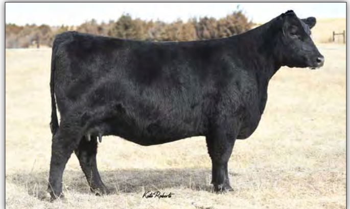
Maplecrest Fanny 0063 - The $120,000 valued dam of Lot 44 working in the Baldrige and Maplecrest Programs