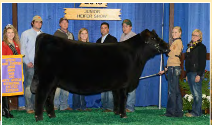
SCC SCH Phyllis 426 Select embryos available.