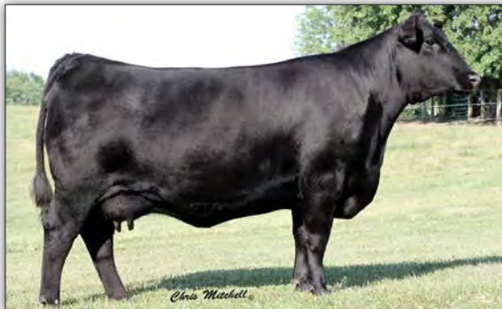
Carter's Vallee X126 - Granddam of Lot 41

This 1/2 blood cow is due January 11, 2024 to WHF Double Up.