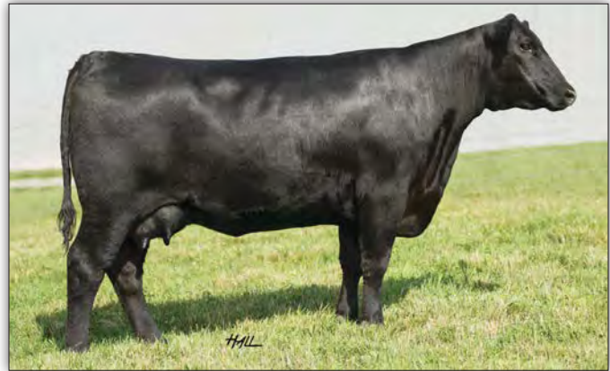
Maplecrest Blackcap 3007 - renowned donor for Maplecrest & Hillhouse programs and dam of Lot 19A, 19B & 19C

This flush sister to 19A posted an IMF ratio of 117 and writes a similar EPD profile with strong carcass merit and a solid HP EPD. Sells due to calve February 14, 2024 to G A R Fireproof.