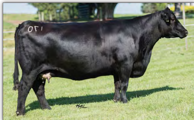
SJH Ms Confidence 170 - Foundation female to our Fanny Family