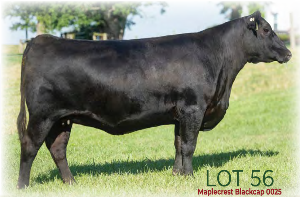
LOT 56 Maplecrest Blackcap 0025

This daughter of Ashland combines individual ratios of 97 for birth, 115 for weaning, 101 for yearling, 123 for IMF and 110 for ribeye with progeny ratios on one head of 102 for yearling, 107 for IMF and 111 for ribeye. 9187 was produced by a maternal sister to the former Select Sires member G A R Anticipation who was a past donor at Maplecrest. While 6026 left the herd too early, she left us with a daughter worthy of donor status. Check out her special growth and Marbling EPDs. She will calve prior to sale day to E&B Wildcat 9402.