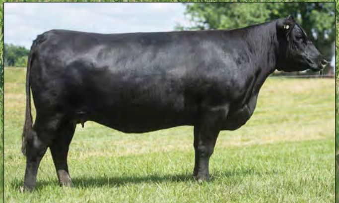
Maplecrest Rita 8097 - Dam of Lot 1

Check out her breed leading $ indexes which are all in the top 1 or 2%. Her productive dam sold as a feature in last year's sale to Dal Porto Livestock in Nebraska.