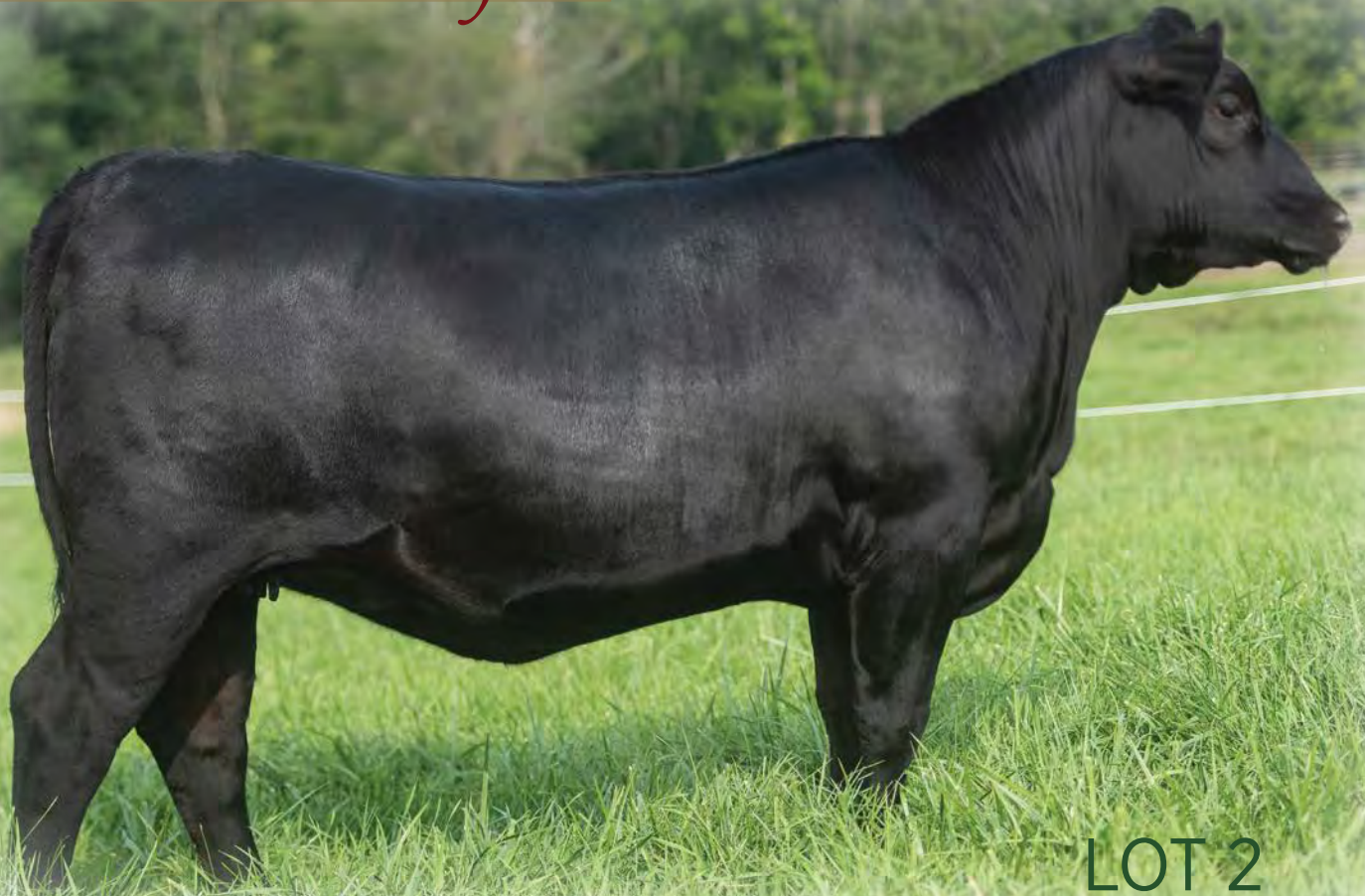
LOT 2 Maplecrest Blackcap 2247