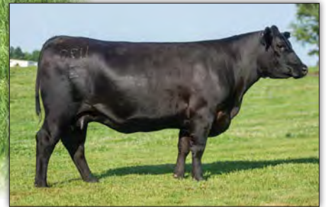
G A R Ashland 1198 - Dam of Lot 28