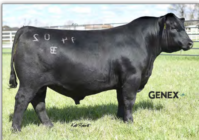
E&B Wildcat 9402 - Popular Service Sire of Lot 64