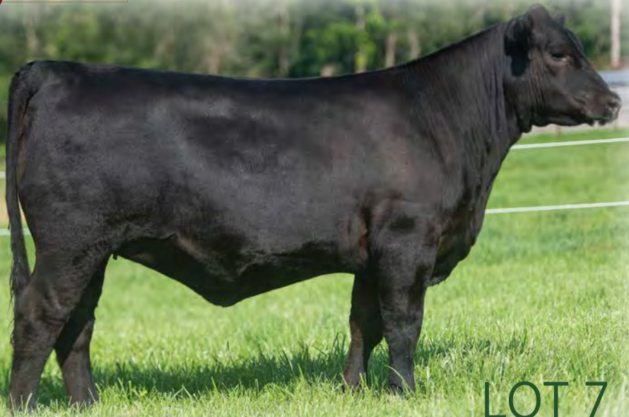
LOT 7 Maplecrest Blackcap 2262