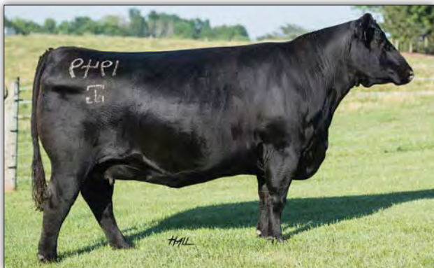
G A R 28 Ambush 1949 - Granddam of Lot 40

This purebred is due January 8, 2024 to WHF Double Up.