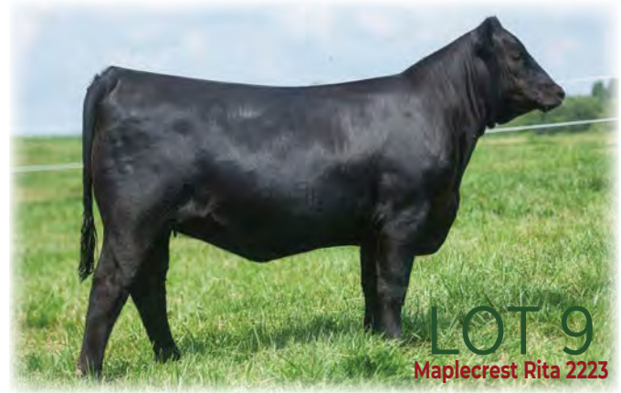
LOT 9 Maplecrest Rita 2223

2223 posted individual ratios of 84 for birth and 121 for weaning and she combines elite calving ease with strong growth and carcass traits that can be used to create desirable herd bull prospects for commercial cattlemen. Her dam, Maplecrest Rita 9210, sells as Lot 59!