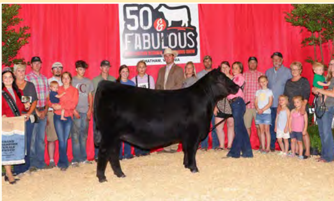
Maplecrest SS GF Phyllis 1080