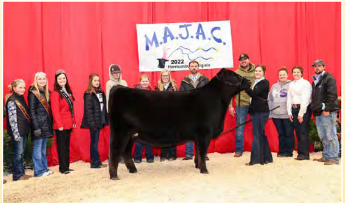
Maplecrest Rita 0231 Maternal sibs to this female sell.