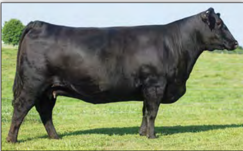
Maplecrest Blackcap 7175 - Pearcy Donor dam of Lot 15

This daughter of Kansas from the Pearcy Angus Ranch donor Maplecrest Blackcap 7175 posted individual ultrasound ratios of 106 for IMF and 114 for ribeye and carries on the genetic strength of the Blackcap cow family. She combines extra calving ease with elite carcass traits and strong $B and $C indexes. Sells due to calve January 7, 2024 to G A R Apex.