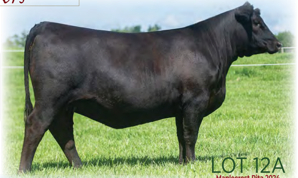
LOT 12A Maplecrest Rita 2024