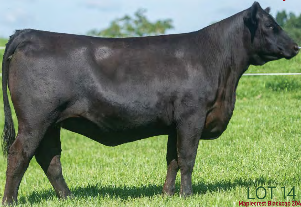
LOT 14 Maplecrest Blackcap 2049