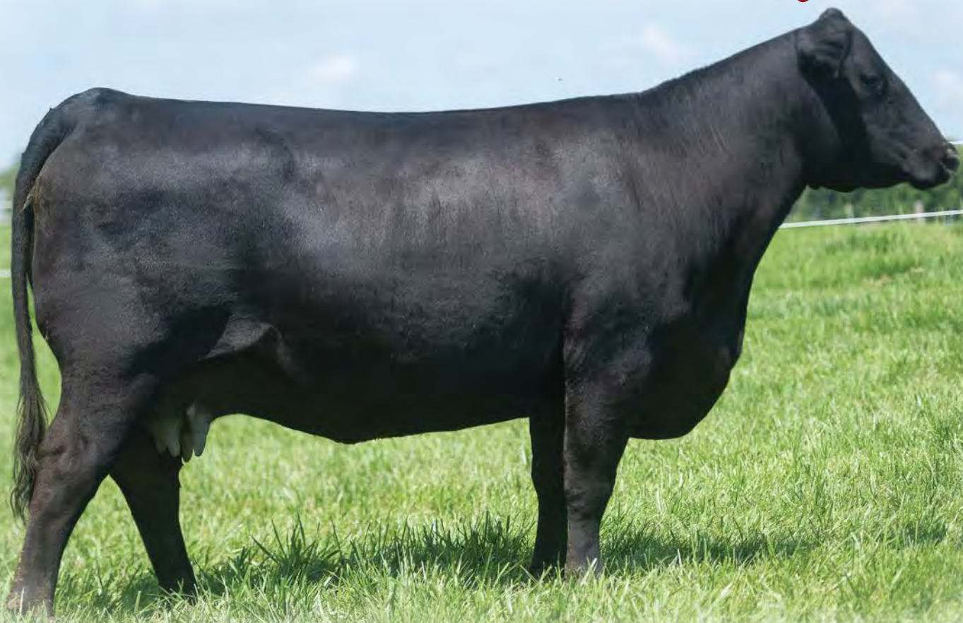
Maplecrest Blackcap R9275 - Lot 58 & Dam of Lot 20