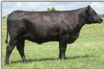
PAR Blackcap 9169 - Dam of Lot 6