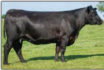
G A R Ashland 1198 - The popular donor dam now working in the Walkers Branch Program in Hamptonville, NC