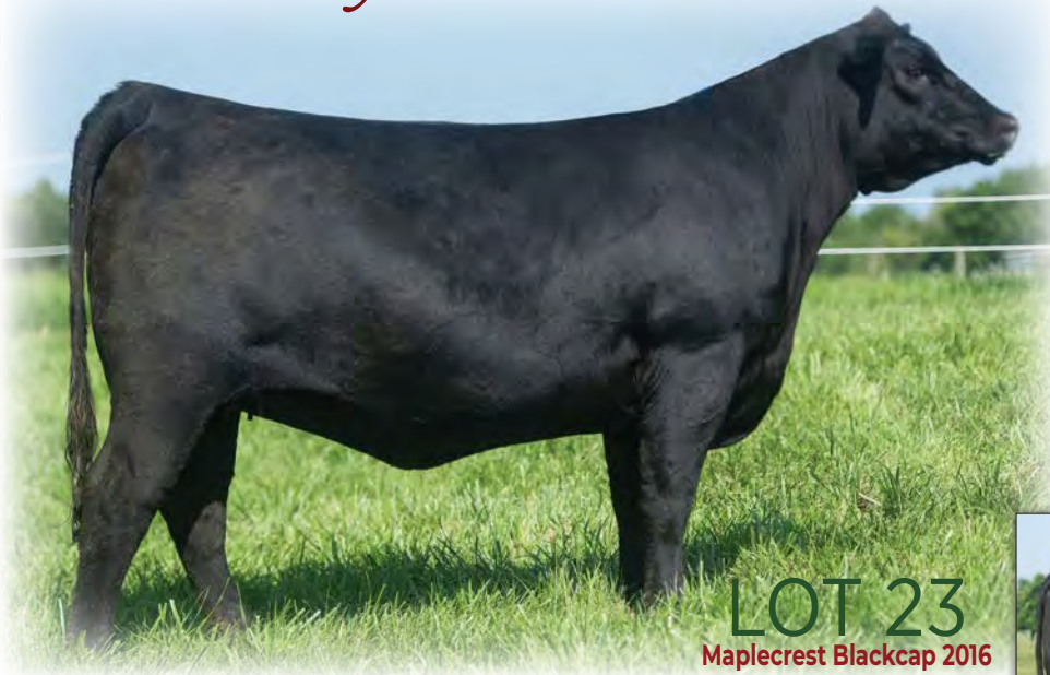
LOT 23 Maplecrest Blackcap 2016