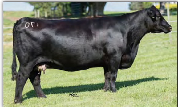
SJH Ms Confidence 170 - Our Foundation Fanny & dam of Lot 42

This 1/2 blood is due January 11, 2024 to WLE Copacetic.