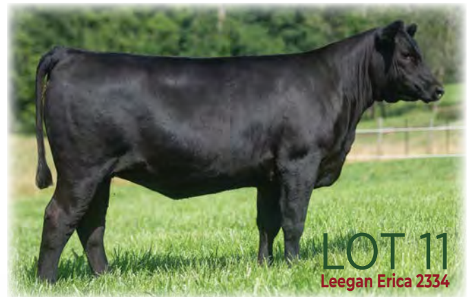
LOT 11 Leegan Erica 2334

This heifer is sired by the popular ST Genetics sire Beal Breakthrough. She blends extra calving ease, excellent growth, positive HP EPD and strong carcass merit. Her maternal granddam is the $100,000 Williams Prop Erica 255-139. A maternal sister sold for $9,000 in the Southern Synergy Sale this spring.