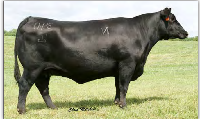
G A R 28 Ambush N340 - Granddam of Lots 22A, 22B & 22C. One of the very best cows to ever reside at Maplecrest

The dam of these flush sisters is an outstanding daughter of Prophet who has been a strong contributor to our program. B2135's "front pasture" looks are complimented by an impressive EPD profile including elite Marbling, strong $ Indexes and a recognizable pedigree. Her granddam is the noted Maplecrest and Hillhouse donor G A R 28 Ambush N340 who produced G A R Ingenuity 3132. F5247 has amassed an impressive production record of 2 at 110 for weaning and 105 for yearling with 45 at 106 for IMF and 103 for ribeye. Sells due to calve February 21, 2024 to GB Fireball 672.