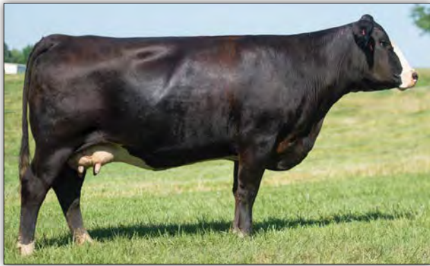
Maplecrest Vixon 708E - Dam of Lot 39 and top selling Simmental bred cow in our 2022 sale

This 1/2 blood female is due January 8, 2024 to CCR Boulder.