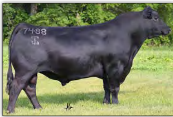
G A R Home Town - Sire of Lots 4 through 8