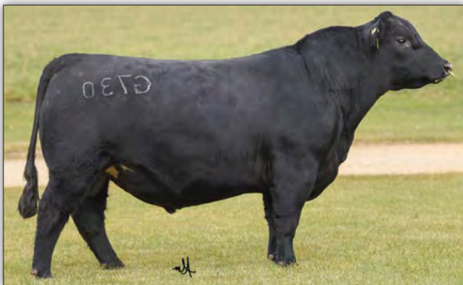
Yon Top Cut G730 - Sire of Lot 2

This daughter of the popular Select Sires feature Yon Top Cut G730 brings a lot of genetic merit to the table. She combines powerful growth, elite HP EPD, excellent carcass traits, with special $ Indexes. In fact, her elite $M combined with explosive growth is truly a rare combination. Her flush sister was the $40,000 top open heifer in the Angus Roundup in Fort Worth this spring. She has EPD's, genomics and phenotype all wrapped into one elite package.