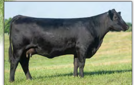
Maplecrest Blackcap R0163 - Donor Dam of Lot 23