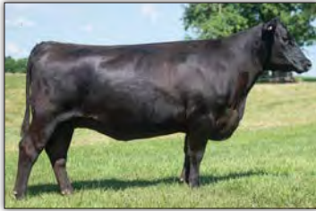
Maplecrest Blackcap 8032 - G A R Sunrise Daughter & Dam of Lot 7