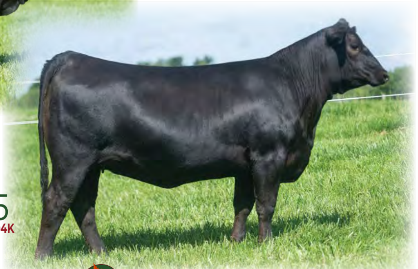
LOT 35 Maplecrest Rita 204K