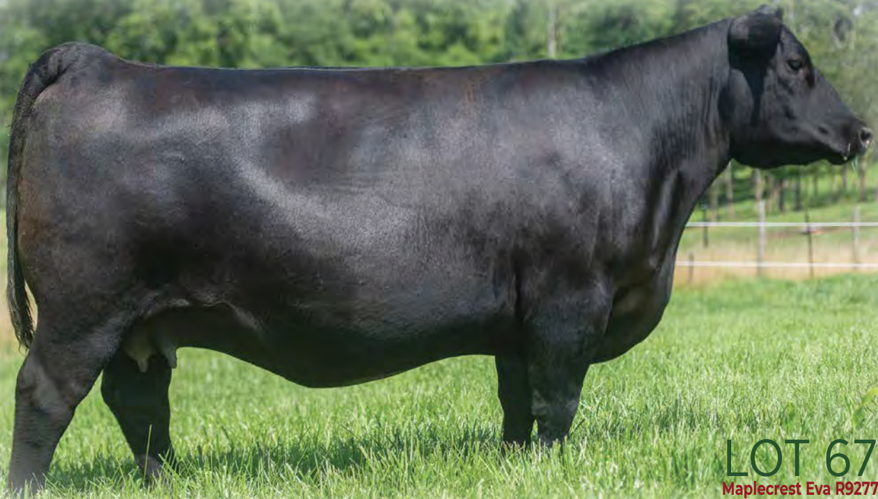
LOT 67 Maplecrest Eva R9277