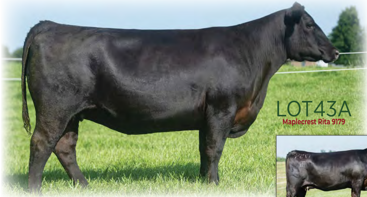
LOT 43A Maplecrest Rita 9179