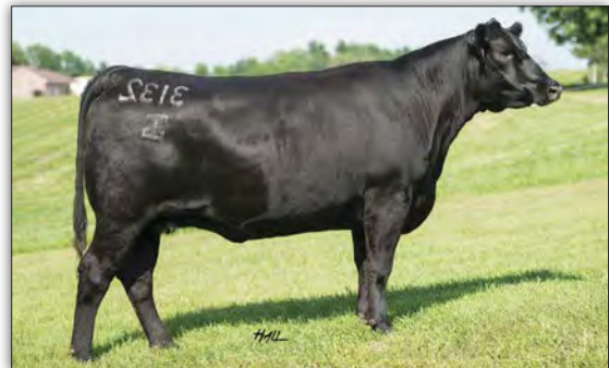
G A R Ingenuity 3132 - Dam of Lot 13A & 13B

Sells due to calve January 28, 2024 to GB Fireball 672.