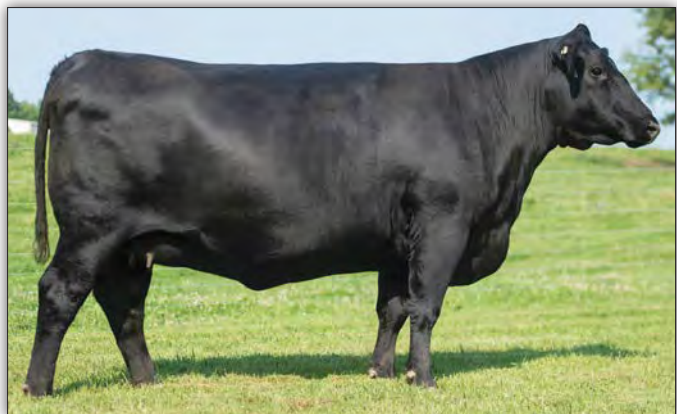
Maplecrest Blackcap 7128 - Prolific donor of Lot 17

This appealing daughter of Kansas comes from a third generation Maplecrest donor that was a 2021 sale feature purchased by Chapman Cattle Company of North Carolina and has 26 progeny ribeye ratios of 102. B2119 possesses strong calving ease, and excellent carcass traits. Sells due to calve January 7, 2024 to Connealy Commerce.