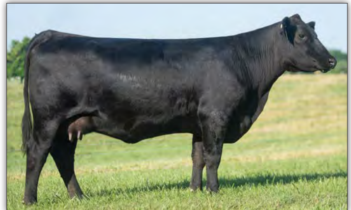
Maplecrest Blackcap R0163 - Maternal sister to the dam of Lots 22A, 22B & 22C

Proven genetics deliver predictable results as you see a similar EPD profile in this third flush sister who posted individual ultrasound ratios of 132 for IMF and 114 for ribeye. Due to calve January 30, 2024 to Connealy Commerce.