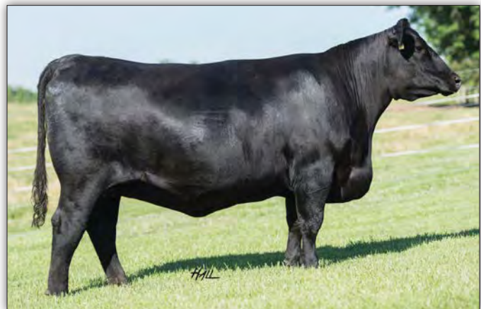
Maplecrest Eva 4019 - Dam of Lots 62 & 67

Saving some of the best for last is this Growth Fund daughter out of a past Maplecrest Donor currently working in the Van Beek Ranch program in South Dakota. R9277 has one progeny turned in to AHIR that shows ratios of 101 for yearling and 102 for ribeye. This female traces directly to Eva 7010 and possesses special growth traits. She will calve prior to sale day to G A R Grass Roots.