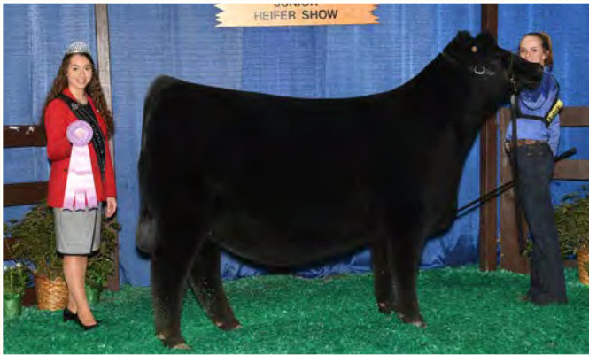
Maplecrest Blackbird B8127 Embryos from this young donor sell!