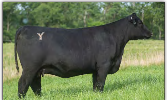
Yon Hazel K158 - Featured Maplecrest & Pollard Donor that is a paternal sister to Lot 3