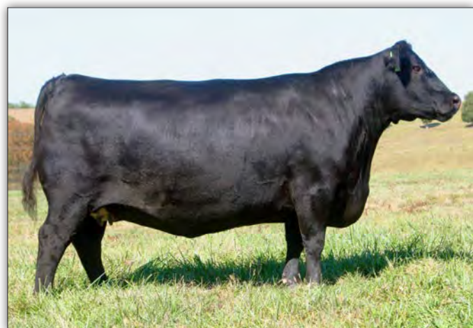
Maplecrest Eva 7010 - Cornerstone of the Eva Family

This daughter of G A R Phoenix comes from the productive Eva cow family. Another high weaning and yearling growth female that excels in carcass merit as well as $Beef and $Combined. Due to calve September 30, 2023 to Poss Rawhide.