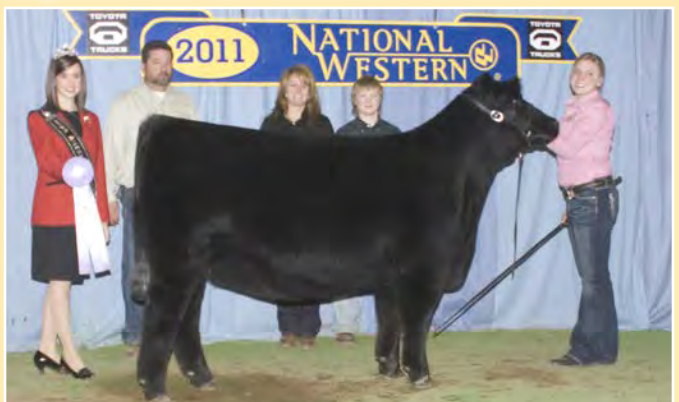
SCC Nellie Girl 980 Embryos from this donor sell.