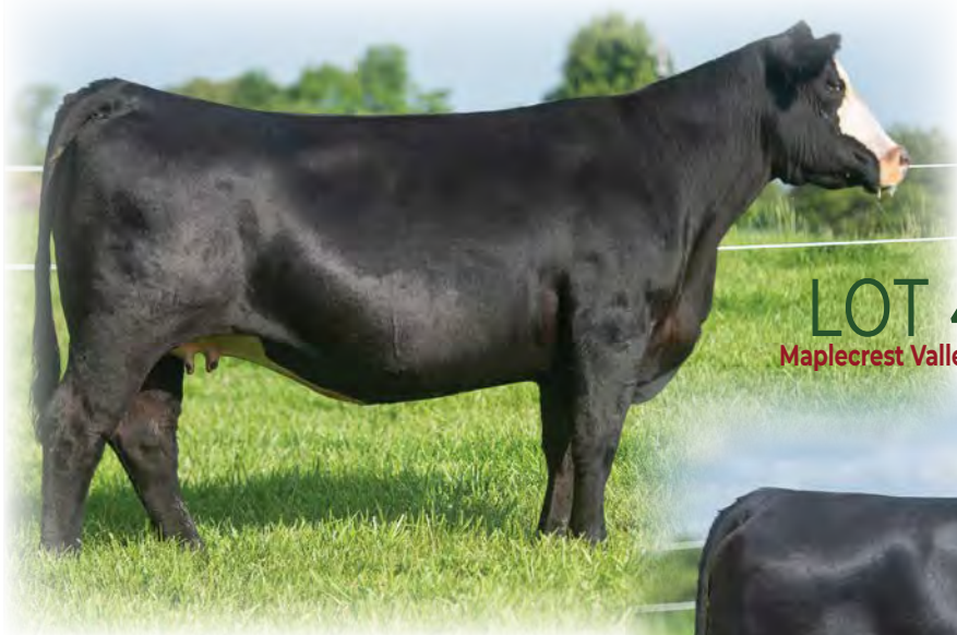
LOT 41 Maplecrest Vallee 862F