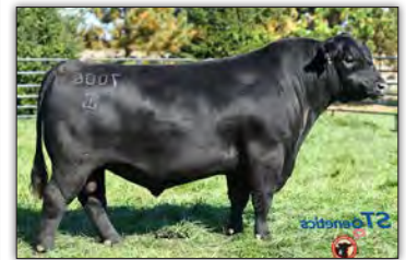
ST Genetics Sire G A R Sunbeam - Service Sire of Lot 12A