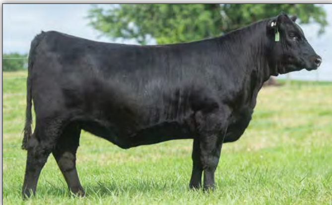
Maplecrest Blackcap 1310 - $68,000 Maternal sister to Lot 3

Here is a direct daughter of the productive and valuable G A R Ingenuity 3132. 2247 features a unique combination of calving ease, growth, along with elite Marbling and Ribeye EPDs. 3132 is the granddam of the popular Genex sire E&B Wildcat 9402 as well as the ST Genetics sire Connealy Commerce. 3132 has over $800,000 in lifetime progeny sales which includes the $68,000 top-selling female in the 2022 Maplecrest sale to ST Genetics.