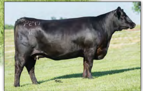
G A R Prophet 1754 - High Growth Dam of Lots 43A & 43B