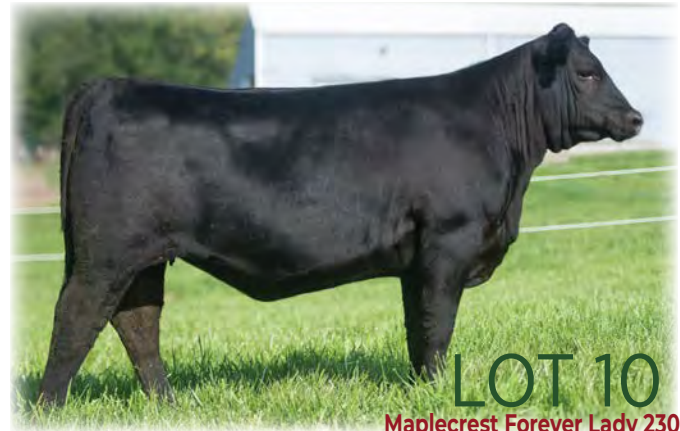
LOT 10 Maplecrest Forever Lady 2307

This interesting prospect is a daughter of the featured Genex sire Iconic. She delivers solid calving ease, explosive growth, and comes from a strong maternal line known for producing extra Marbling which helped place this female in the top 1% for that valuable trait.