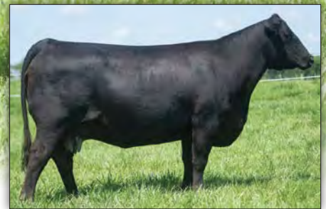
Maplecrest Blackcap R9275 - Lot 58 & Dam of Lot 20