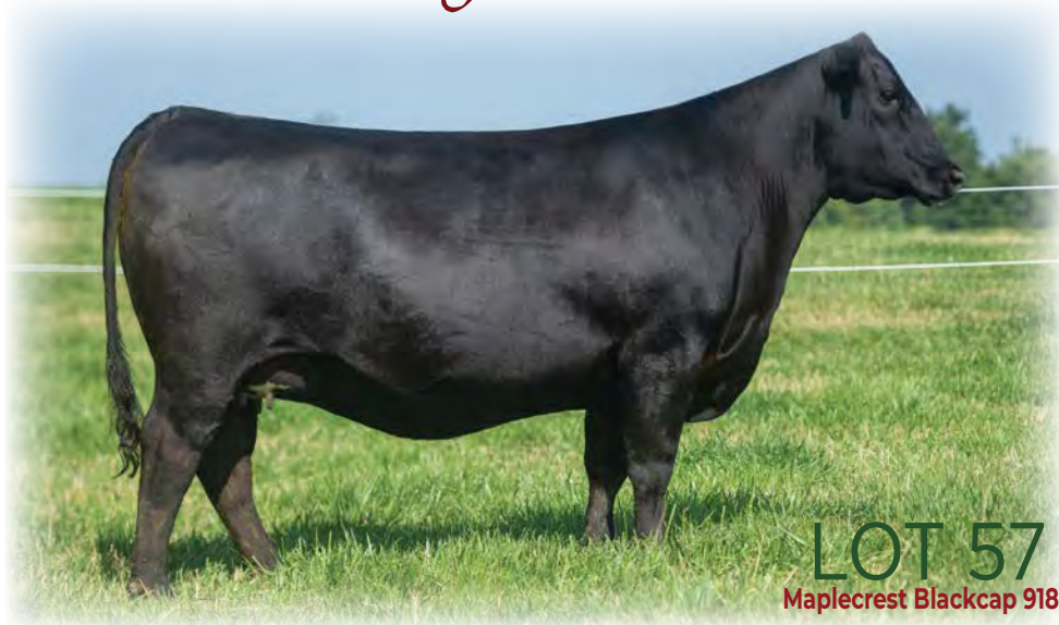
LOT 57 Maplecrest Blackcap 9187