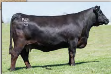
G A R Prophet R65 - Granddam of Lot 29