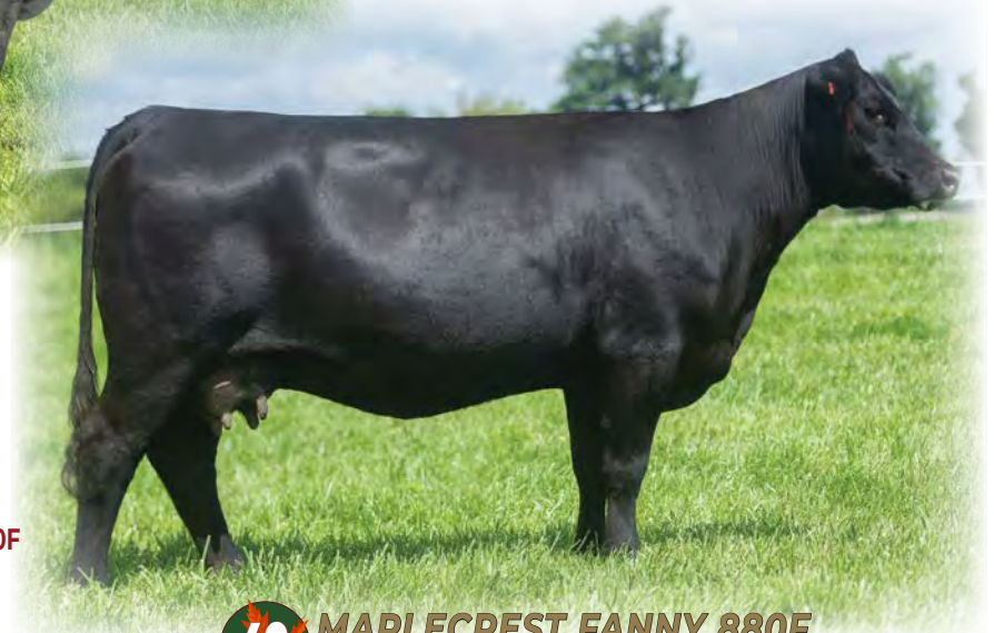
LOT 42 Maplecrest Fanny 880F