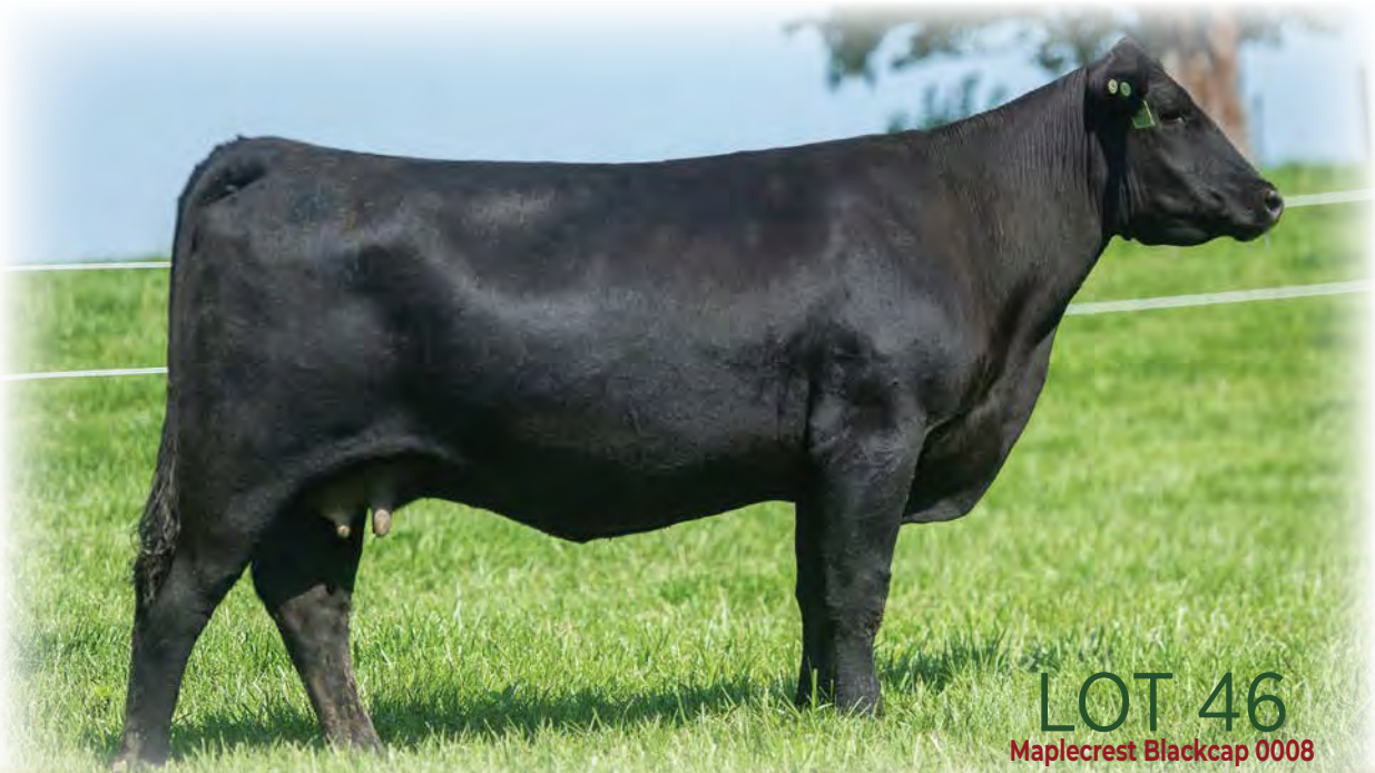
LOT 46 Maplecrest Blackcap 0008

Don't overlook the genetic possibilities with this daughter of GAR Phoenix. 9222 has elite projections for growth and Ribeye along with an impressive set of $ Indexes. Her granddam is Maplecrest Rita 2026 who was a past Grand Champion Female at the Canadian Royal Winter Fair, Grand Champion Bred & Owned Female at the Atlantic National, and Reserve Grand Champion Bred & Owned Cow/Calf Pair at the NJAS. Due to calve January 11, 2024 to HPCA Veracious.