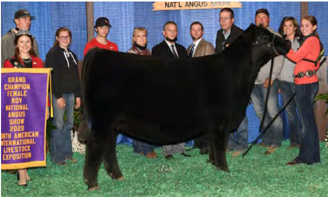
Maplecrest Phyllis 9043 Maternal Sibs to this female sell.