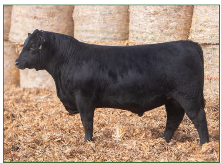
\textit{Maplecrest Quantum J1350} \bullet \textit{Sells as Lot 3}

Here is the first of four flush brother Quantum sons from the third generation Maplecrest donor that was a feature in our 2021 Production Sale purchased by Chapman Cattle Company of North Carolina. He presents a unique opportunity to add multi-trait excellence to herds that want to produce high value feeder calves and quality replacement females.