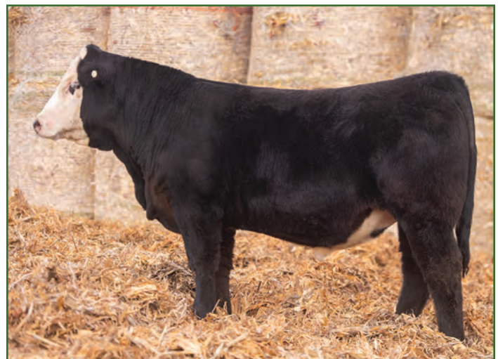
Hall Mc Copacetic K208 • Sells as Lot 51