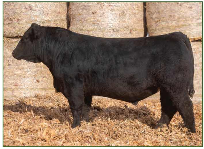
Maplecrest County O 137J • Sells as Lot 18

We lead off the fall yearling Simmental division with this powerful black Sim-Angus son of the popular ST Genetics sire Geff County O. His dam is an impressive daughter of the highly proven ABS sire Boulder.