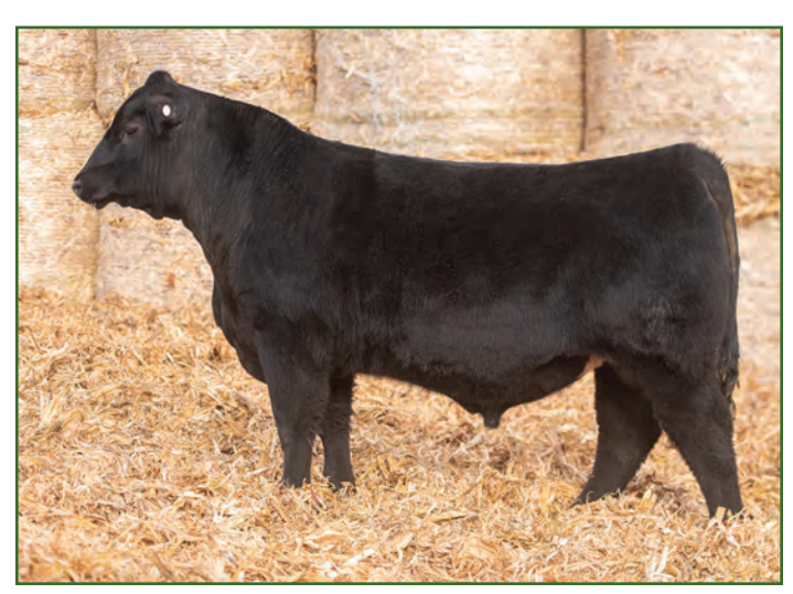
Maplecrest GreaterGood J2072 • Sells as Lot 31

This second flush brother writes a very similar genetic script to the previous bull.