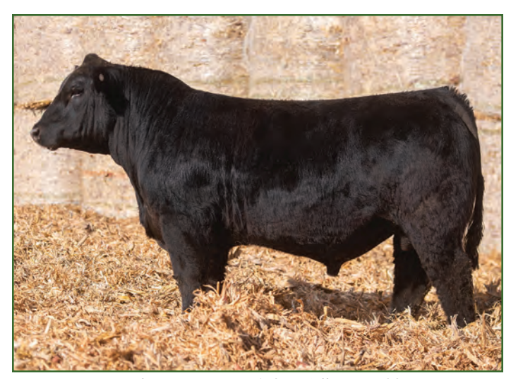
Maplecrest County O 153J • Sells as Lot 20