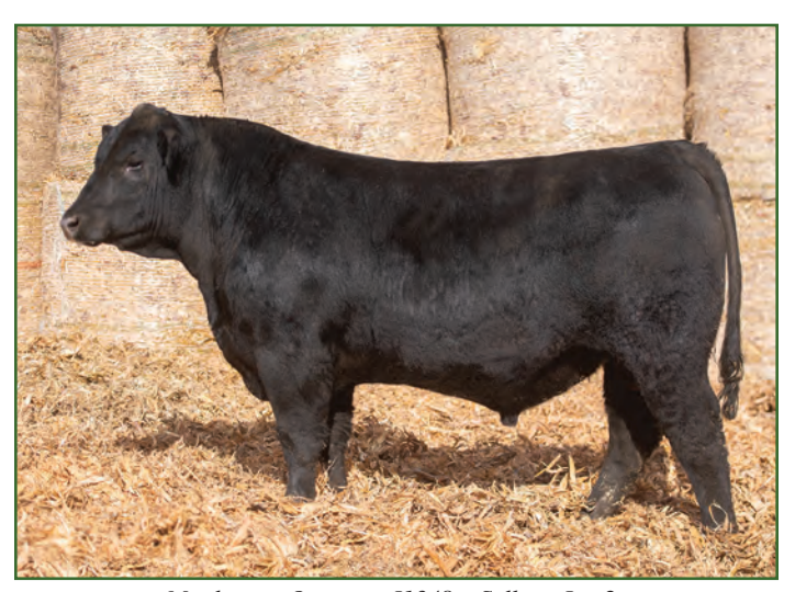
Maplecrest Quantum J1348 ◆ Sells as Lot 2

We lead off this year's sale with a long bodied son of Quantum who is a member of the Select Sires lineup. He combines excellent growth, strong carcass merit, and desirable Dollar Indexes. His productive dam is currently working at Ramsey Cattle LLC in Alabama.