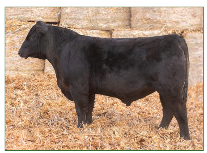
Maplecrest Touchdown J2103 • Sells as Lot 26