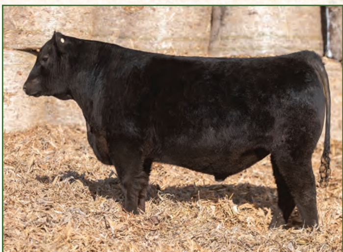
Maplecrest MCD Optimum J2043 • Sells as Lot 38