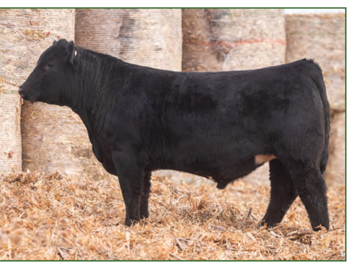
Maplecrest Lover Boy 211K • Sells as Lot 47