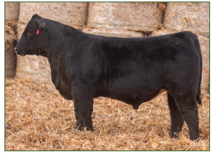
Maplecrest County O 213K • Sells as Lot 46

This attractive son of the ST Genetics feature County O out of a daughter of the past North American Reserve Grand Champion Percentage Simmental Bull Halls Confidence A30.