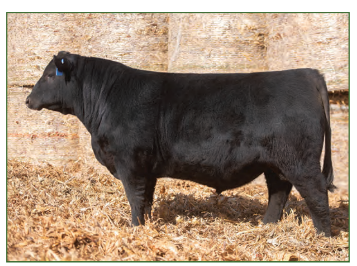
Locust Grove Top Notch 205 • Sells as Lot 39