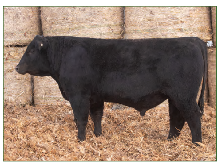
Maplecrest Quantum J1257 • Sells as Lot 1