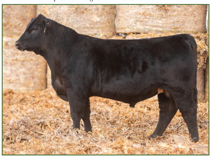
Maplecrest GreaterGood J2060 • Sells as Lot 29