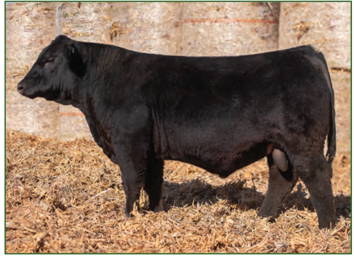
Maplecrest Double Up 205K • Sells as Lot 45

We lead off the spring yearling Simmental division with this excellent purebred son of Double Up, the Reserve Grand Champion Simmental Bull at the 2021 Cattlemen's Congress. This bull should add growth and muscle to your next calf crop.