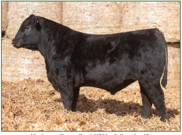
Maplecrest GreaterGood J1236 • Sells as Lot 12

This Dual Threat son traces directly to the past Maplecrest donor 1949, a maternal sister to G A R Prophet. His Marbling, Ribeye, $B, and $C EPDs rank in the Top 10% of the breed.