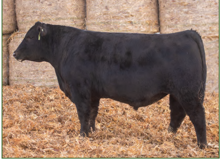
Maplecrest Emerald J1316 • Sells as Lot 8

This Quantum son will add extra growth and muscle to your next calf crop.