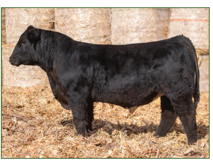
Maplecrest County O 140J • Sells as Lot 19

This purebred son of County O is out of a dam sired by the proven performance leader and featured Genex sire Cowboy Cut. Extra length of body and a little "chrome' to grab your attention towards this excellent prospect.