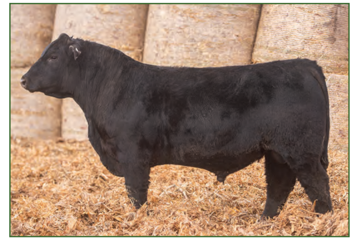
Maplecrest Emerald J1287 • Sells as Lot 9

This Quantum son comes from one of the best daughters of Ashland to be found anywhere. 1198 served as a donor for Gardiner Angus Ranch and Maplecrest before selling as a feature in our 2022 Production Sale to Walkers Branch Angus in North Carolina. This herd sire prospect possesses a special combination of calving ease, growth, and carcass merit.