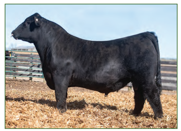
Maplecrest Style J1118 • Sells as Lot 17

If you are looking for a bull that excels in phenotypic evaluation, here he is! This stout made individual comes from a family known for show ring success. He was named Reserve Grand Champion Bull at the 2022 Ohio Angus Preview Show. A full sister, Maplecrest Phyllis 9043, was named Grand Champion Angus Female at the 2020 North American International Livestock Exposition and Reserve Grand Champion Female at the 2020 National Junior Angus Show. Another full sister, Maplecrest Phyllis 0082, was named Reserve Grand Champion Owned Female at the 2021 Eastern Regional Junior Angus Show.