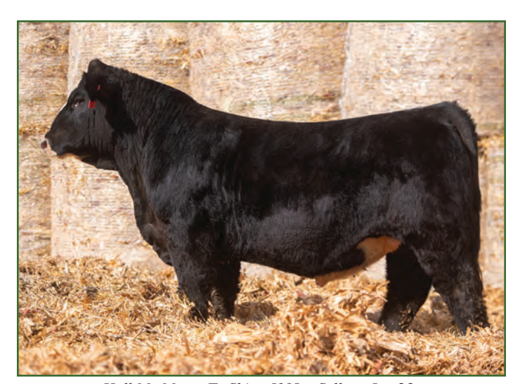
Hall Mc Meant To Shine J109 • Sells as Lot 23